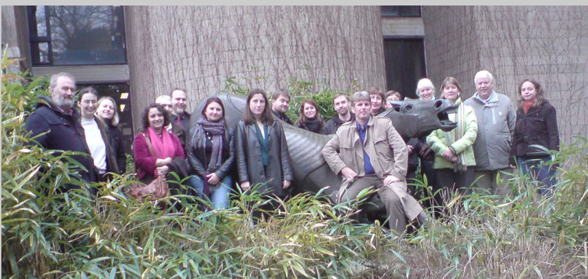
Partner meeting in Leuven