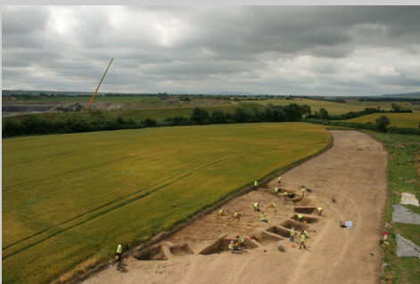
Excavation of Ballybannon early medieval ringfort in advance of road construction, Carlow, Ireland.