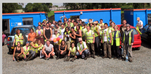
Part of a team of 121 archaeologists from 14 countries excavating a wetland complex, Ederclon, Co. Longford.