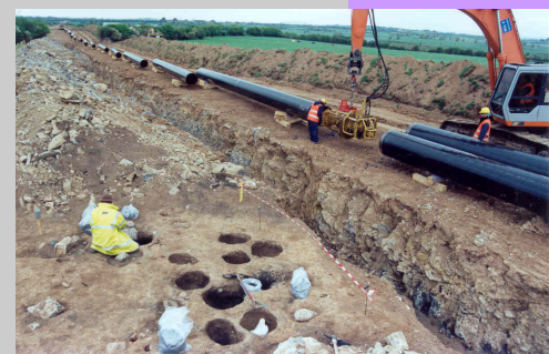
Excavation of Rathcannon Middle Bronze Age cemetery during gas pipeline construction.

Employers highlighted a range of archaeological training priorities for current and potential employees with project management (53%), landscape characterisation (50%), information technology (50%) and a general need to improve field-work skills being the major areas identified.